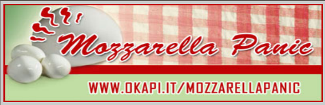
Mozzarella Panic Tour